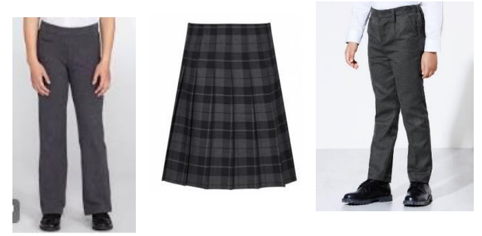
General appearance -

Trousers should be grey school trousers – not skinny or jeans type, stretch material or cropped. Alternatively, pupils can wear the branded school skirt (worn at the correctly length).